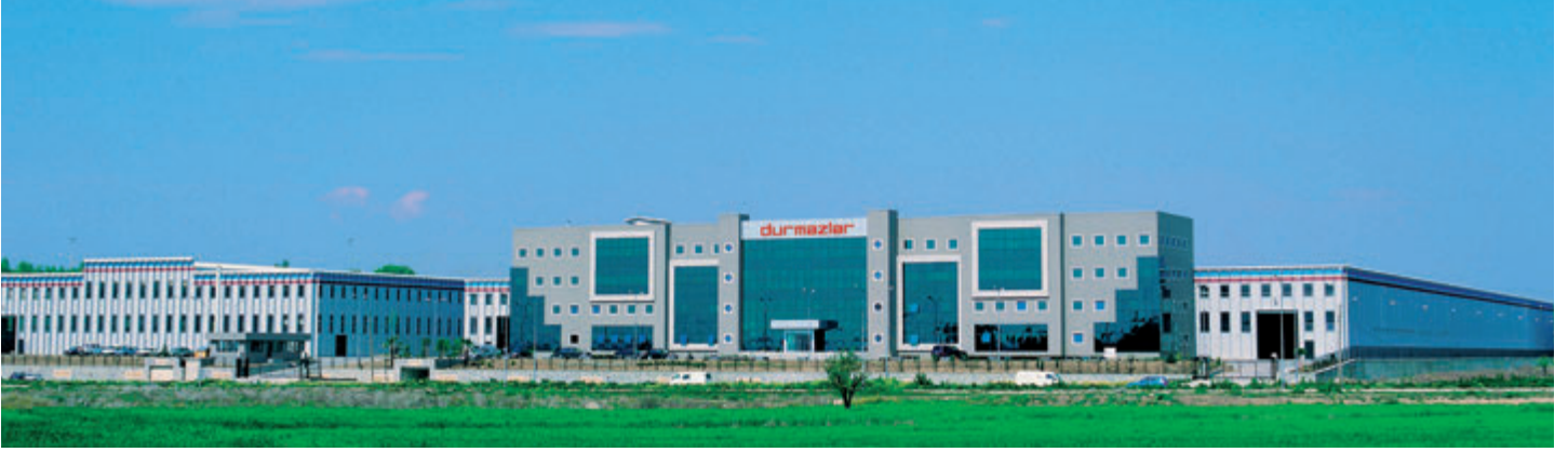
Head Quarter & Ataevler